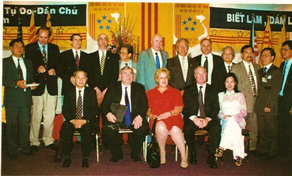
Honorary Members of ICFV representing all chapters in the world with Oversea Representative of the Movement to Unite the People and Build Democracy in Vietnam and Executive Members of Central Committee of Alliance for Democracy in Vietnam