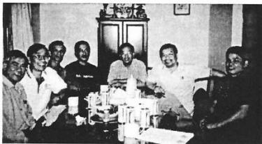
Meetings in Edmonton

Another meeting has been scheduled once the House is sitting in September